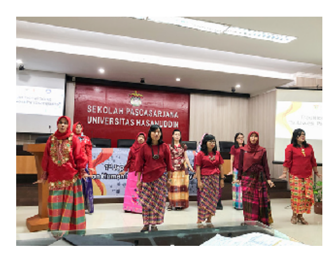
Traditional Song "Sulawesi Pa'rasanganta" was performed at the opening ceremony of the seminar

More than eighty attendees including health care professionals, scientists and researchers with a range of medical experiences from Japan and Indonesia participated and shared their experience and concerns related to heavy metals intoxication in this seminar.