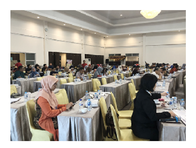
Participants including health care professionals, scientists and researchers with a range of medical experience from Japan and Indonesia.