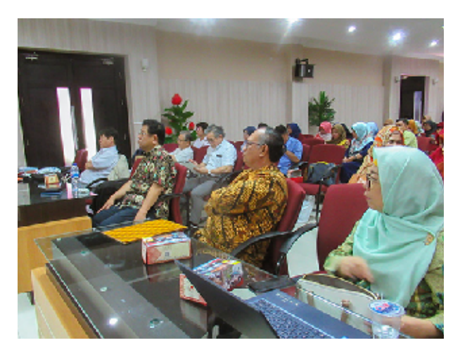
Attendees from Makassar University, Kumamoto Gakuen University, Ehime University and Research Institute for Humanity and Nature

The purposes of the seminar are to share the information of Minamata disease and current challenges, and to discuss the diseases related to the consequence of heavy metals intoxication.