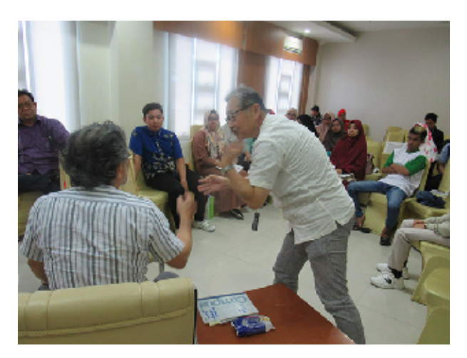
Activity from the 2nd Japan - ASEAN medical seminar on the human health impact of heavy metals