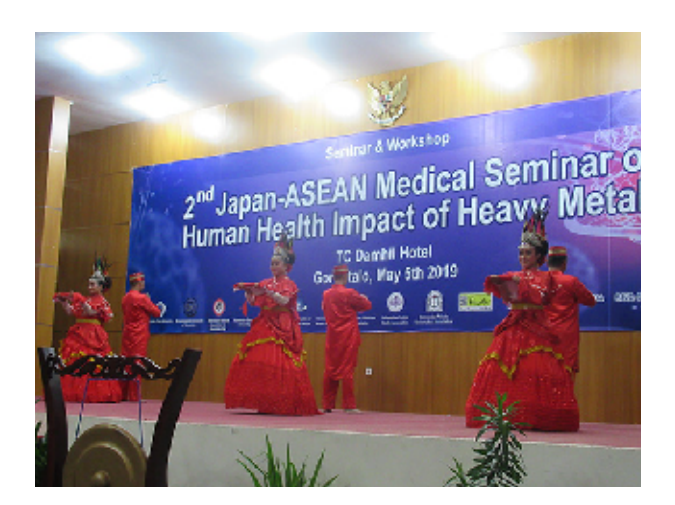
Performance dance named "Kreasi Saronde" at the opening ceremony of the seminar

There were more than one hundred and thirty participants including health care professionals, scientists and researchers with a range of medical experience from Japan and Indonesia. They shared their experience and concerns related to heavy metals intoxication in this seminar.