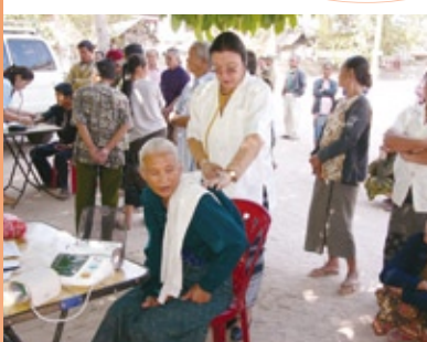
Field clinical services at a local village, Savannakhet Province, Lao PDR. Medical doctors from the National Institute of Public Health provide medical advice and treatment free-of-charge to the villagers.

The Ethos Initiative examines the noöspheric values and dynamics affecting human ecological knowledge, especially in relation to the key areas of food production and human health. The Initiative describes the relationship between environmental knowledge, including that embedded as cultural value and sense of self, on quality of individual and community life.