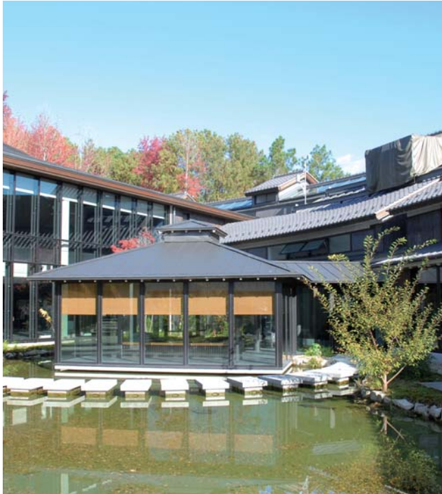
Breezeway between buildings