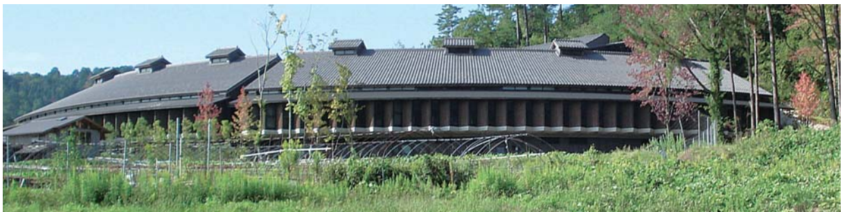
Two views of the RIHN building and site in the north of Kyoto