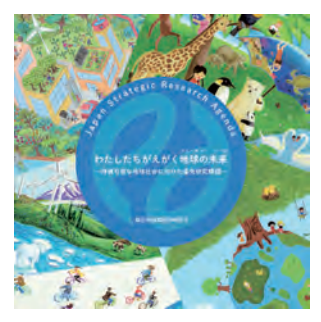
Japan Strategic Research Agenda (JSRA)

The JSRA was developed in collaboration with stakeholders to identify priority research areas to contribute to a sustainable future while optimizing Japan's distinct research arenas.