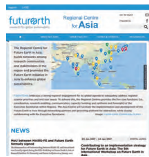
Regional Centre for Future Earth in Asia Website

The JSRA was developed in collaboration with stakeholders to identify priority research areas to contribute to a sustainable future while optimizing Japan's distinct research arenas.