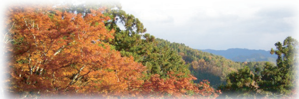
Autumn colors at Kurama, KYOTO