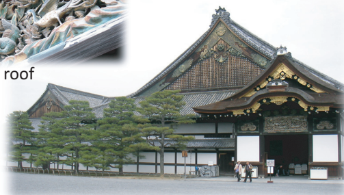
Nijyo Castle, KYOTO