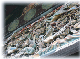
Carvings of roof