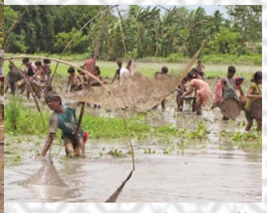
Fishing in rice paddies Assam, India Villagers fish in the rice paddies while planting rice in the monsoon flood season KOSAKA Yasuyuki